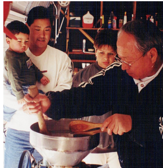
Pounding and helping smash the rice into a machine to make mochi

Growing up, I remember going to Northern California (Morgan Hill/San Jose area) to spend time with my great-grandmother. We would go to our auntie and uncle's house the weekend between Christmas and New Year's Day for mochitsuki, the Japanese tradition of making rice cakes. We would make bets on college football games, run around the rural streets and play with the neighborhood kids, and the adults would always gather around the table to play a Japanese card game called hanafuda.