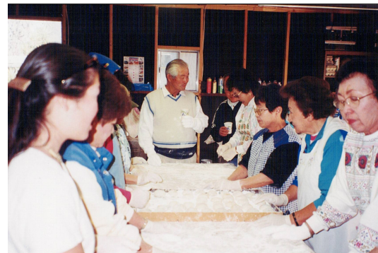
The women and girls in the family would gather around the table with